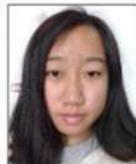
Biaknginglovi Indovance Civil 3 LPA