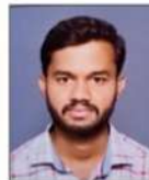
Ashtavinayak Landage Capgemini Civil 4 LPA